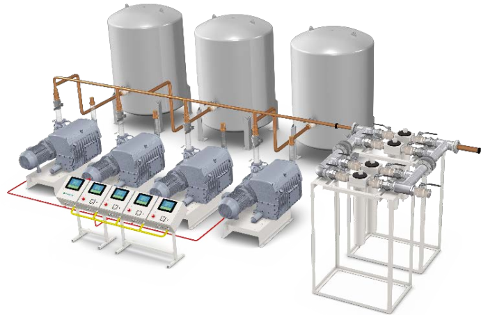
Typical vertical vessel configuration

For plant above 500L/m all inter connecting pipework between components to be made on site and provided by the installer. All control and starter cubicles will be supplied with connecting wire harnesses of 5m in length to suit standard configurations.